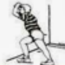
25. Gastrocnemius Stretch (keep knee straight and heel down, feet facing forward)