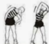
11. Lateral Flexion Stretch (one side, then the other, push pelvis across as you bend)